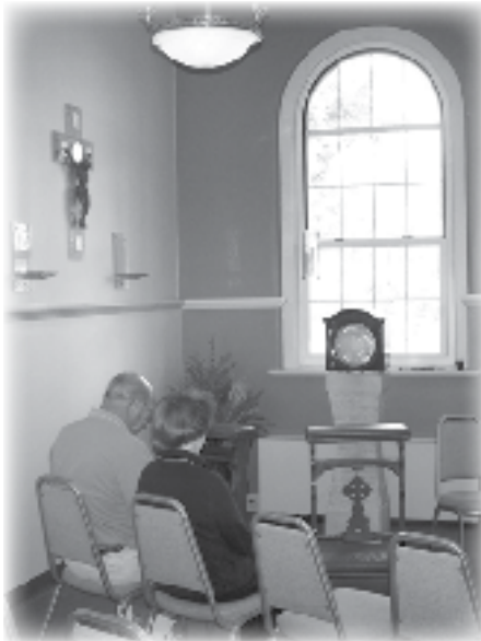
Retreatants pray in the Mount Saint Joseph Center Chapel during the October 2007 Marian Retreat.

"Thank you" seems so simple when we come to a time like this in the history of an organization. In 1983, the Ursuline Sisters of Mount Saint Joseph made a difficult decision to close the Academy. Times were changing, and girls were no longer coming to the boarding school. The sisters knew it was time to do something different. They followed the advice of Saint Angela Merici to look at the signs of the times and see what new