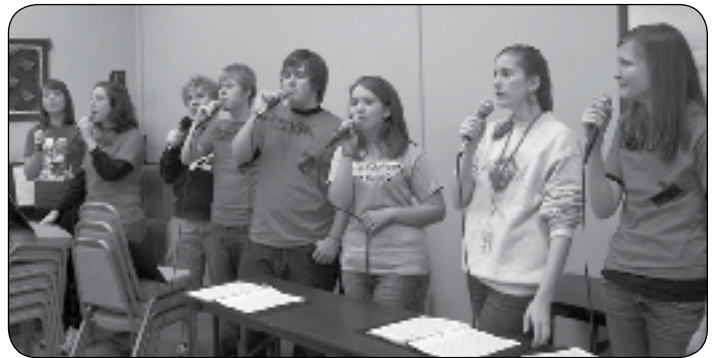
Members of the Access Assured music ensemble from First Baptist Church in Owensboro spent two days at the Center practicing for their upcoming Christmas concert.