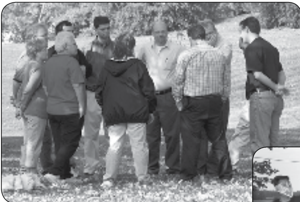
The Daramic Corporation decided to utilize the Center for a communications/long-range planning retreat. Several activities were held outside during the beautiful days of autumn. RIGHT: Members of Daramic work through a trust activity during their retreat.