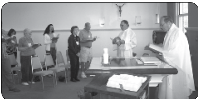
rnard and Fr. ebrate -7 the focus liness.