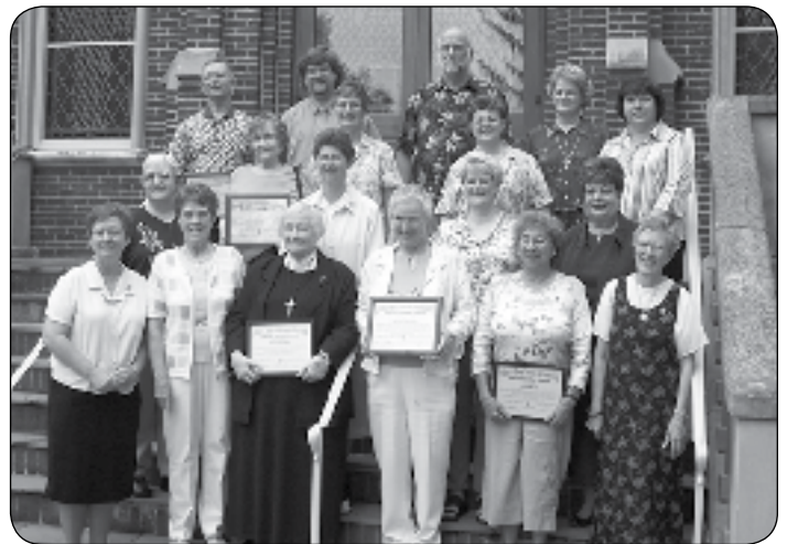
The first Spiritual Direction Institute graduating class of 2004-2006

Biographies of many saints, including Ursuline founder Saint Angela Merici, tell us that many people sought guidance from holy people in their quest for a holy life. People today continue to search for competent spiritual directors who will walk with