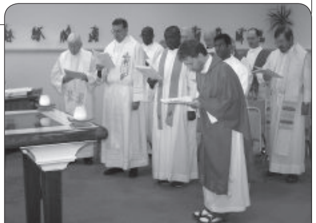
Priests of the Owensboro Diocese pray the Liturgy in the Center chapel at their Oct. 27-31, 2008 retreat.