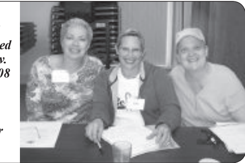
ed v. 08