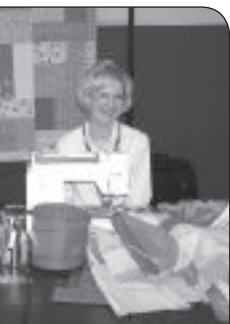
nois, left, and sky, sew during the Quilters retreat.