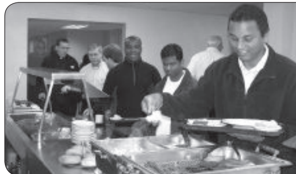
Several priests enjoyed a brunch before returning to their parishes after their October retreat.