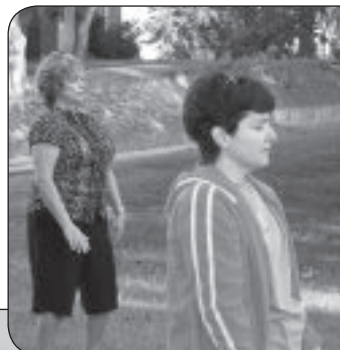
Participants at a Sept. 19-21, 2008 Yoga and Meditation retreat learn about Qi Gong, which focuses on air and energy.