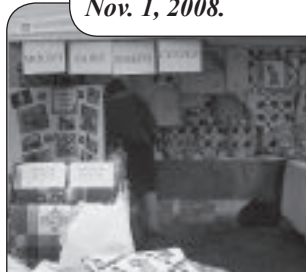
The Center had a booth at Reid's Apple Festival Oct. 18-19, 2008.