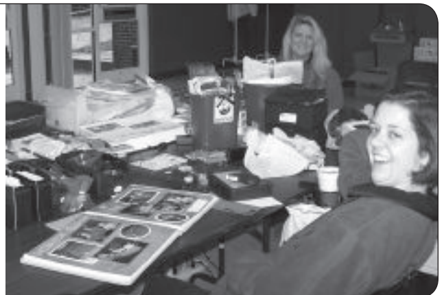
Participants smile during the Nov. 14-16, 2008 Scrapbook Swarm retreat. The many attendees enjoyed sharing ideas with others while spending time on a fun, favorite hobby.