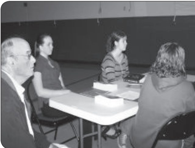
Youths and staff from St. Mary Parish in La Center, Ky., attend an Oct. 17-19, 2008 retreat prior to their Confirmation.