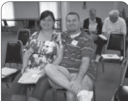
Several couples attended the Aug. 29-31, 2008 Marriage Encounter weekend at the Mount.