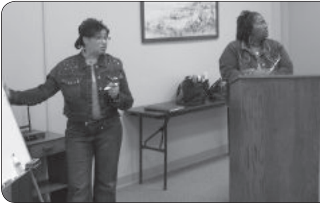
Members of the Black Expo planning committee met at the Center on Nov. 1, 2008 to outline their work for the next Expo.