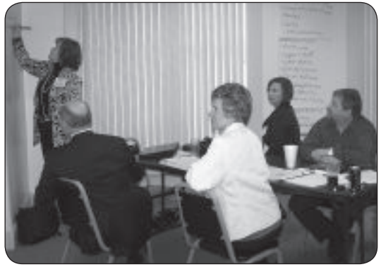
Members of the Owensboro Community & Technical College planning committee met Nov. 13 to update plans for the coming year.