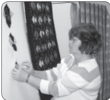
ABOVE: A Runaway Quilter pins a fabric sample to a board.