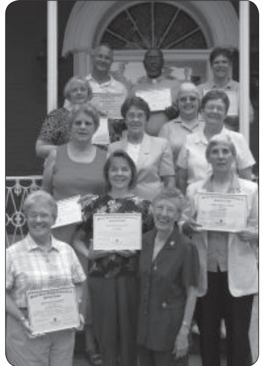
The 2006-08 Spiritual Direction Institute and members of the SDI coordinating team pose for a group photo at the July 2008 certificate ceremony at Mount Saint Joseph Conference and Retreat Center. The 2008-10 class will be having its closing ceremony in July.

The two-year program consists of four weekly training sessions each year. Each session covers a different topic, and attendance is required in order to receive certification as a spiritual director. Spiritual direction means directing and guiding persons to a deeper relationship with God through prayer, meditation, and discernment. It is the art of listening to and supporting others while creating an atmosphere of openness, honesty, and prayer.