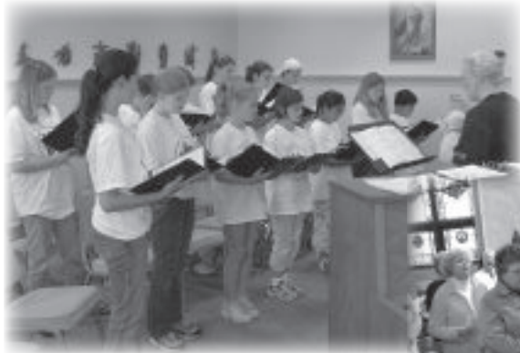
Left: Young choir members practicing at Mount Saint Joseph. Below: The Ursuline Sisters sing in celebration of electing new leadership in December 2009.