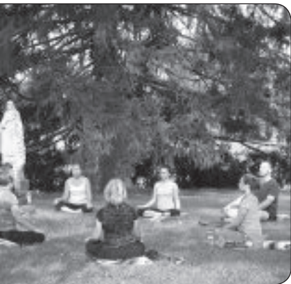
Yoga and Meditation group took time in the beautiful surroundings of the Mount to rest and relax Sept. 18-20.