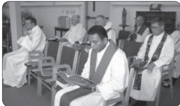
RIGHT: Priests gather for prayer in the Retreat Center chapel during their Oct. 26-30 retreat.

Find more photos on the Web www.msjcenter.org