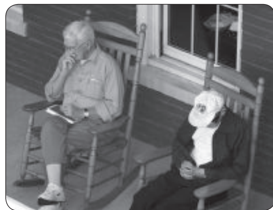
Glenmary priests pray and reflect during their Sept. 14-18 retreat at the Center.

Find more photos on the Web www.msjcenter.org