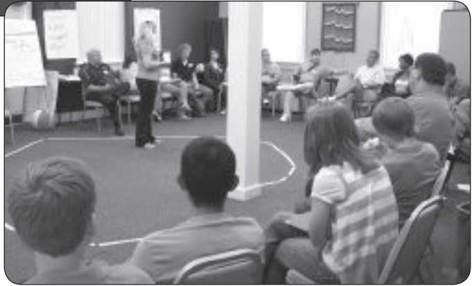
LEFT: Members of the McLean County Leadership Coalition met Sept. 28 at the Retreat Center.