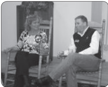
Participants from Hospice have a discussion at a Nov. 6-7 retreat. The group gathered to rest, renew, and brainstorm ideas.