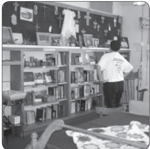
A retreat visitor in October looks at items available for sale in the Mount Saint Joseph Book & Gift Shop.