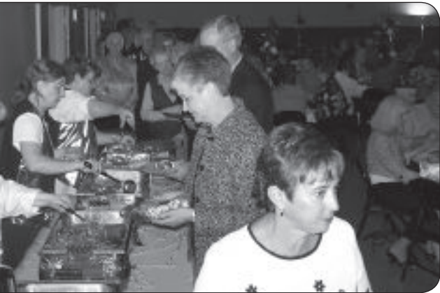
Frey on er and enjoy er usam any ociate board