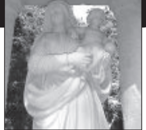
Our Lady of Prompt Succor Maple Mount, Ky.

In light of Pope John Paul II and Pope Benedict XVI's call for Christians to become more distinguished in the art of prayer, our Marian Retreat will take us to "Mary, a genuine school of prayer." We will go to Mary to learn prayer in a better way and to pray in a deeper way.